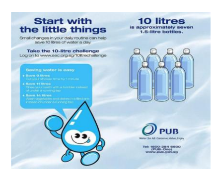
Figure 4. The 10-Litre Challenge [23].

use of 160 liters person per day in 2005 to 154 liters person per day in 2010. Expected continues to decline until 147 liters person per day in 2020.